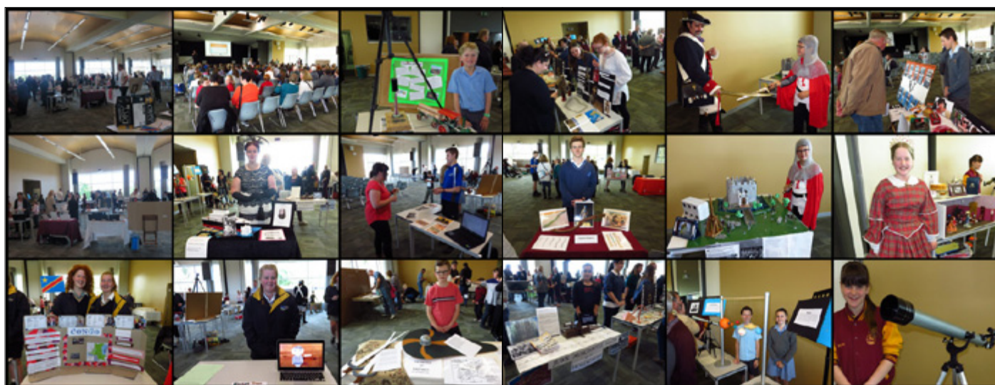
Photos: HEP Highlights Expo Collage